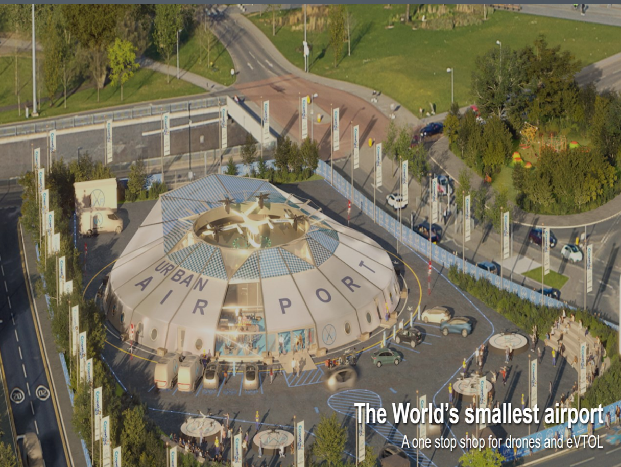
The World's smallest airport A one stop shop for drones and eVTOL